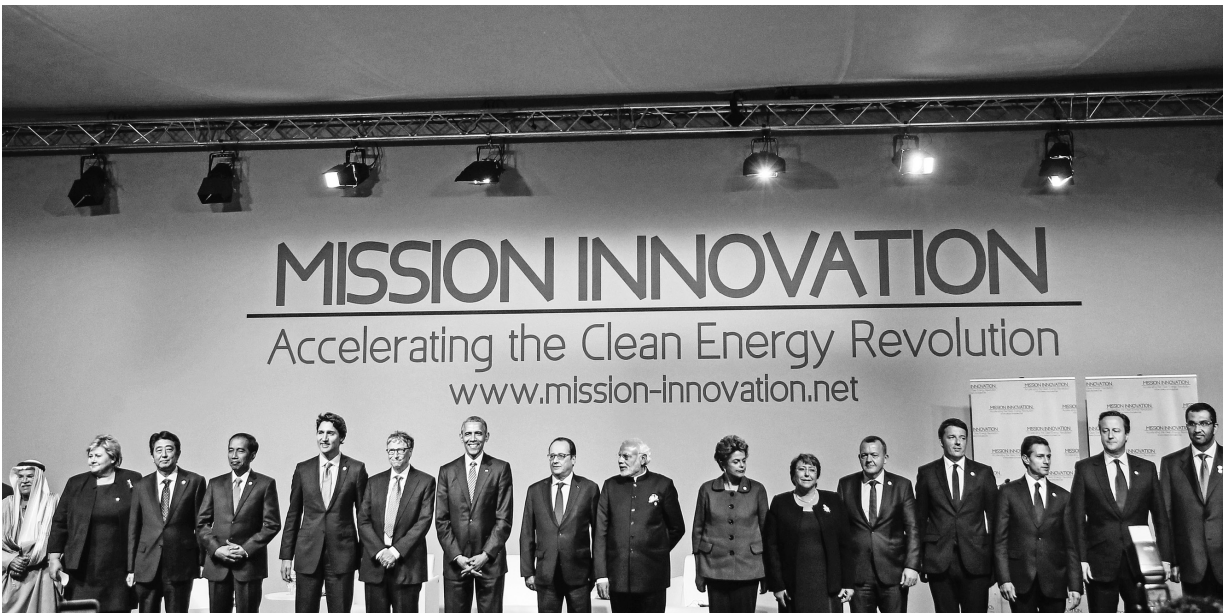
Launching Mission Innovation with world leaders at the 2015 UN climate conference in Paris. (See this page for the names of those photographed.)

The next turning point in this story will be grimly familiar to everyone reading this book.